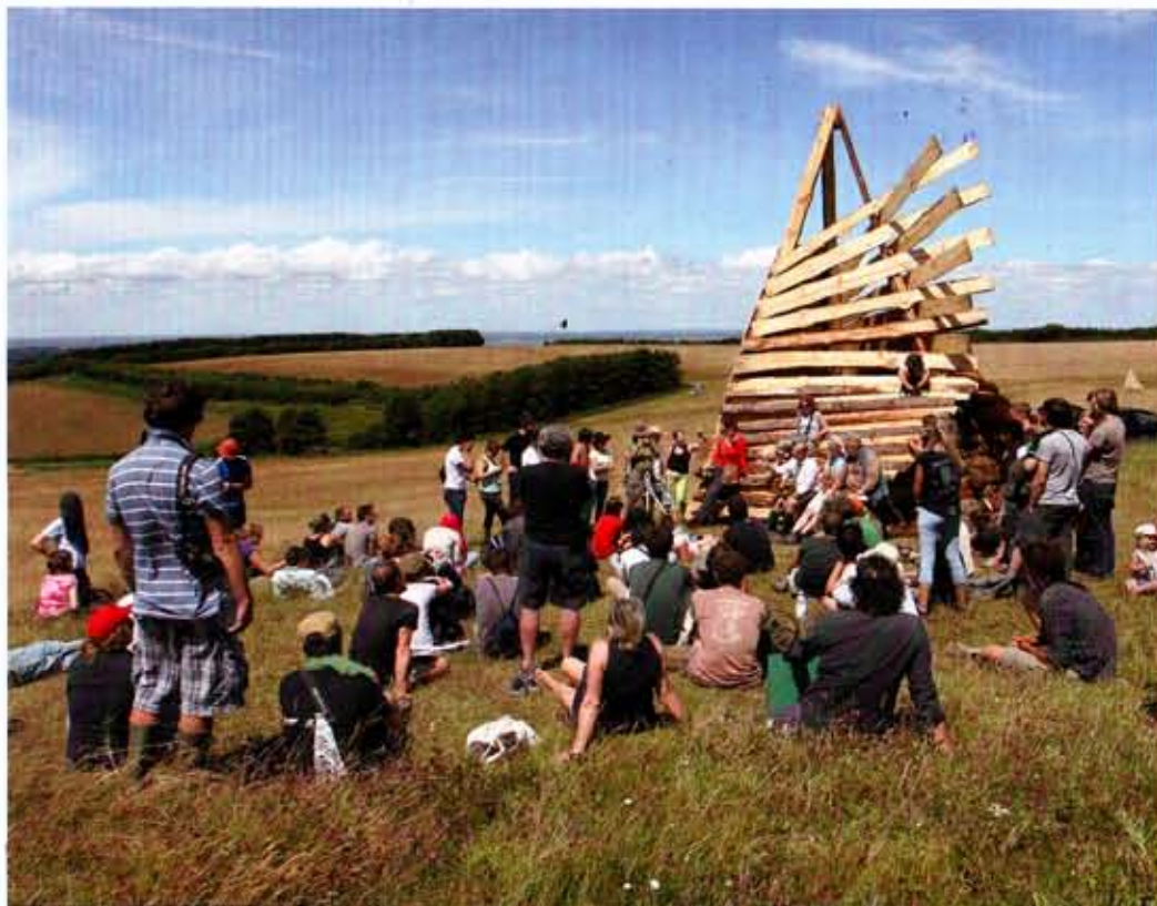
Students visiting Studio Weave's finished Fire Folly beacon.

As such collaborations suggest, this was far from being just a bunch of hippies waving chainsaws in the woods, the event